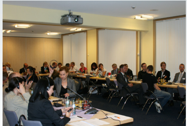
Project partners at the kick-off meeting in Bautzen, Germany (22–23 June 2010)

Specialists from Germany, Austria and Sweden introduced the participants with informative presentations about innovation, innovation audits and state aid programmes. This conference finished with presentations of regional innovation systems and implementation strategies for PROINCOR by the project partners.