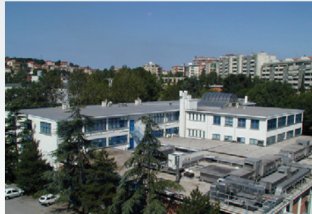
BIC Incubatori FVG SpA

From 8th till 10th June 2011, BIC Incubatori FVG SpA will host the PROINCOR Steering Group Meeting and Transnational Innovation Advisory Group Meeting.