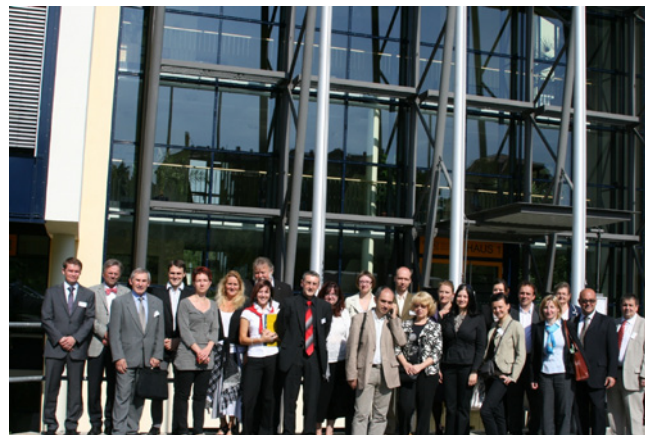
Innovation conference in Bautzen, Germany (22–23 June 2010)